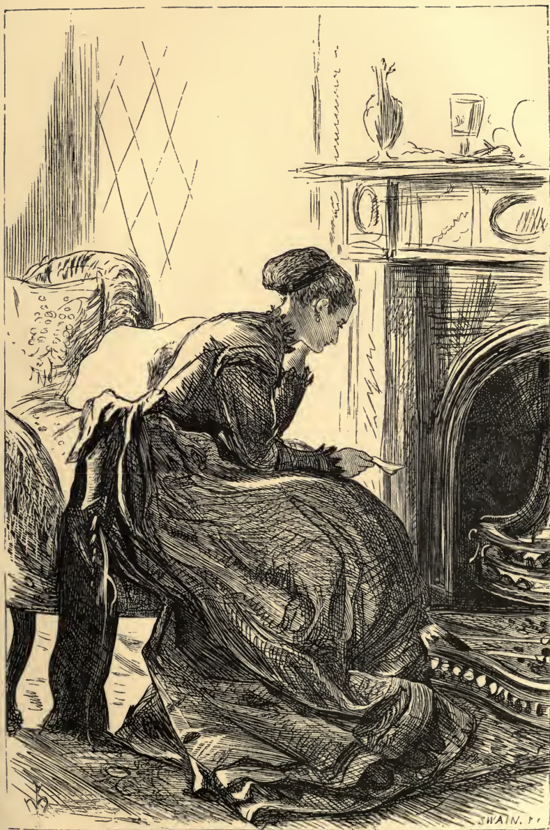
“ So she burned the morsel of paper.”